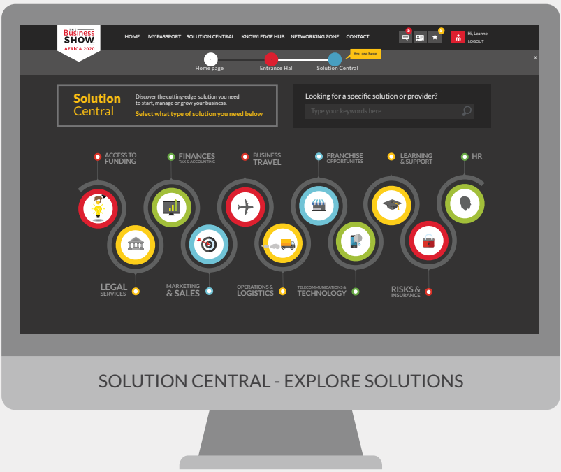
SOLUTION CENTRAL - EXPLORE SOLUTIONS