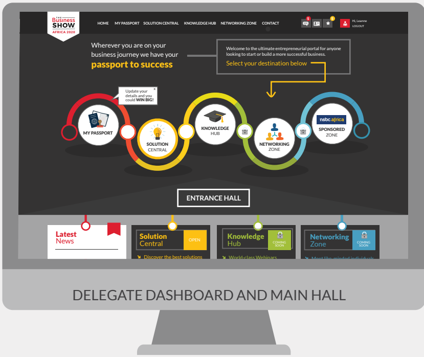
DELEGATE DASHBOARD AND MAIN HALL

Delegates will register to receive their Passport to enter the Business Show and are transported to a fun, interactive and engaging platform - A one-stop-shop for all their business needs. Once logged in, they will arrive at The Entrance Hall upon which they will have access to a variety of business-building zones. These include: YOUR EXHIBIT LOCATION (Solution Central) OPPORTUNITY TO HOST A WEBINAR (Networking Zone)